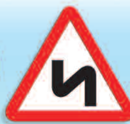
WE DON'T DEAL DIRECT