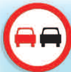
NEW CAR REPLACEMENT