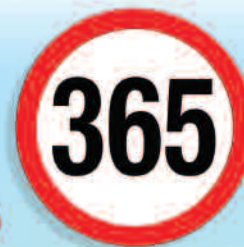
365 DAYS COVER IN THE EU