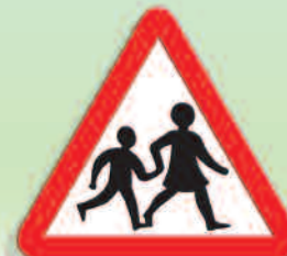
REPLACEMENT CHILD SEATS